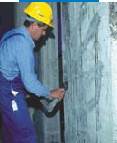
Preparing the substrate