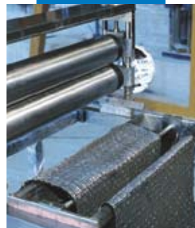
Impregnating Mapewrap C with a machine