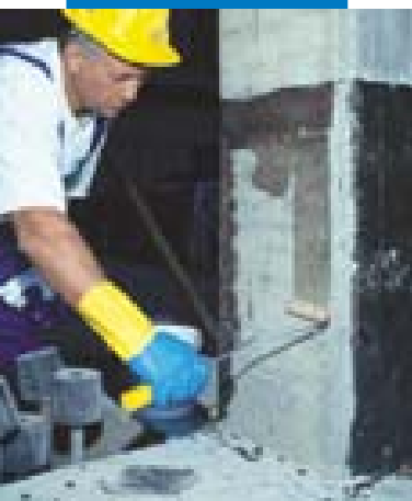
Applying Mapewrap Primer 1