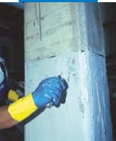
Smoothing with Mapewrap 11 or Mapewrap 12

plaque method), the use of Mapewrap C QUADRI-AX fabrics will adapt to any contours of the element that needs repair. It does not need temporary reinforcement during placing and removes all risks of corrosion of the applied reinforcement.