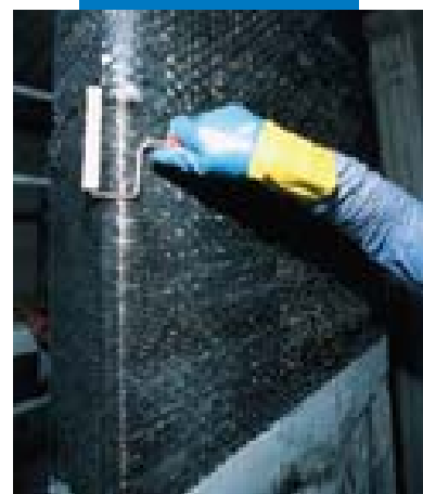
Applying a second coat of Mapewrap 31

N.B. - Although the technical details and recommendations contained in this product report correspond to the best of our knowledge and experience, all the above information must, in every case, be taken as merely indicative and subject to confirmation after long-term practical applications: for this reason, anyone who intends to use the product must ensure beforehand that it is suitable for the envisaged application: in every case, the user alone is fully responsible for any consequences deriving from the use of the product.