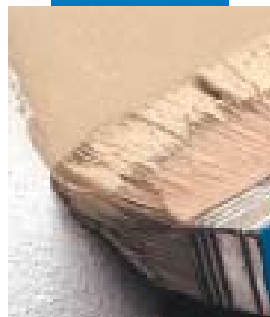
Coating with Elastocolor