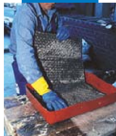
Manually impregnating Mapewrap C