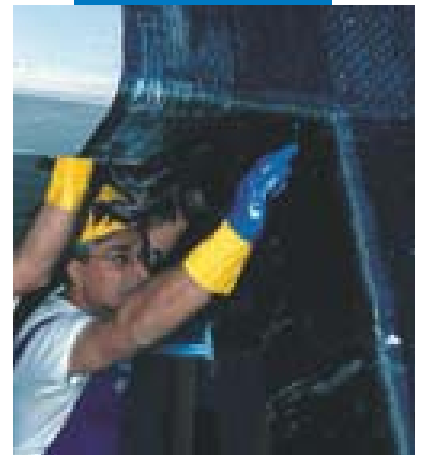
Wrapping a hitch